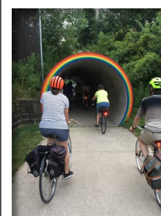
Snap a photo at the Rainbow Tunnel and post #ICBikeride

The 5th Street Loop will add about 1 mile to your ride. Reward yourself for the long ride by stopping off for nuts, smoothies, tacos, or empanadas along the do-