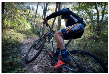
Woodpecker Singletrack: 5.9 miles of trails extending east and west of Camp Cardinal Blvd. along the creek.