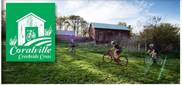
Creekside Cross: 2.6 miles of mowed bicycle course + 2 miles of flow track. Open July 1 –Dec. 31.